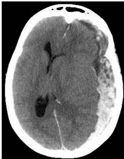
Recent bleeding (subdural hematoma) in an injured patient is seen as a bright mass that is pushing the brain to the other side.

Computed tomography (CT), sometimes called CAT scan, uses special x-ray equipment to obtain many images from different angles, and then join them together to show a cross-section of body tissues and organs. CT scanning provides more detailed information on head injuries, stroke, brain tumors, and other brain diseases than do regular radiographs (plain x-ray films). It also can show bone, soft tissues and blood vessels in the same images. CT of the head and brain is a patient-friendly exam that involves radiation exposure.