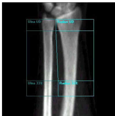
DEXA scan of wrist.